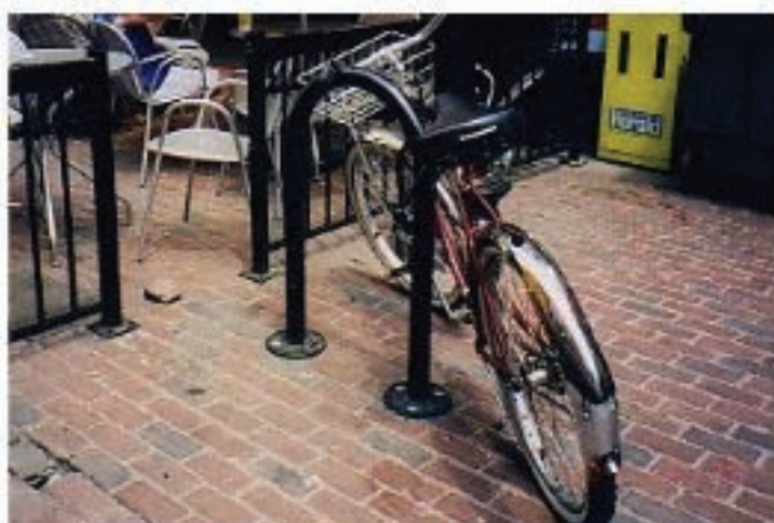
6 BA-2S (YE): Bike-Arch™