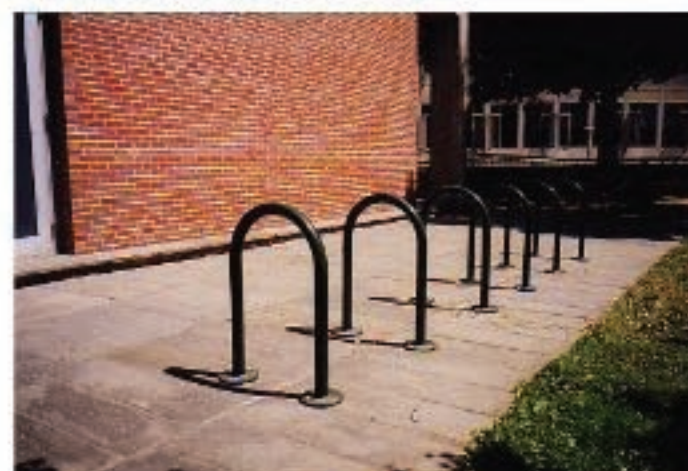
6 BA-2S (YE): Bike-Arch™