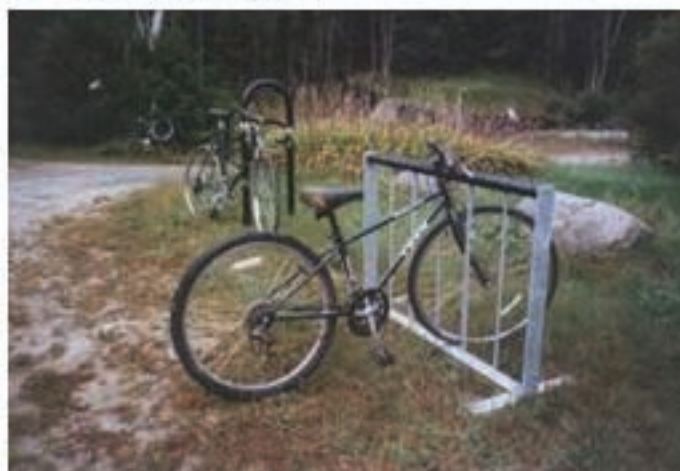
6 BA-2S (YE): Bike-Arch™