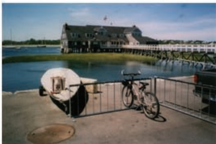
1 BSR-12.9: Bike-Standard-Rail™